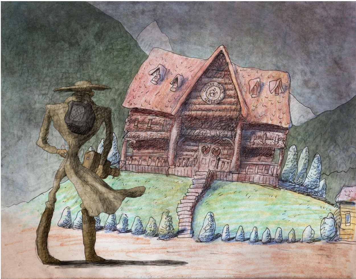
SLIDE, BG Red Flat - B, by Bill Plympton @2023