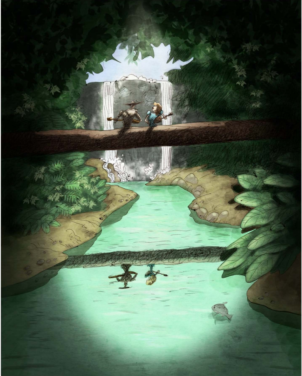
SLIDE, Music Duo, by Bill Plympton @2023