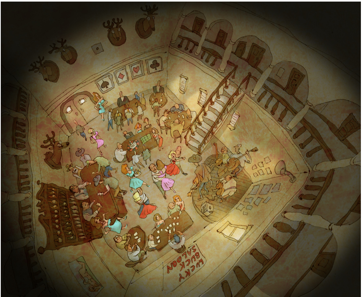
SLIDE, Saloon Staircase, by Bill Plympton @2023

Although it is not a political film, Slide does address some important issues: environmentalism and gun control. This film should easily qualify for the Guinness Book of World Records for having the most evil killers of any major motion picture.