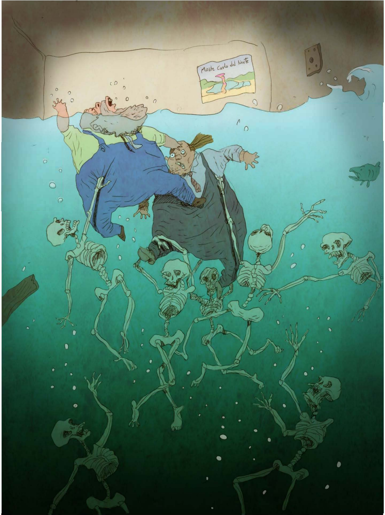
SLIDE, Skeletons, by Bill Plympton @2023