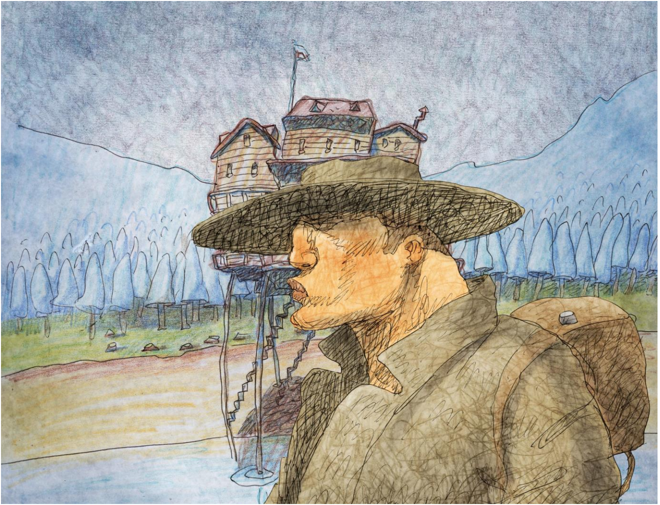
SLIDE, BD..Red FLAT - B, by Bill Plympton @2023