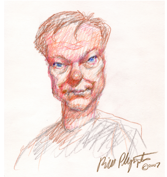
Self Portrait by Bill Plympton @2023

Bill's new film "Slide" brings together many facets of his early life: growing up in the logging forests of Oregon, his father's love of country music (Hank Williams, Patsy Cline), his love and affection for cowboy culture and mythology, and his ambition to be a slide guitarist, playing local bars in New York with his celebrated musical partner, Maureen McElheron. This hand-drawn, hand-made ballpoint pen and colored pencil creation is undoubtedly the masterpiece of his long and celebrated career.